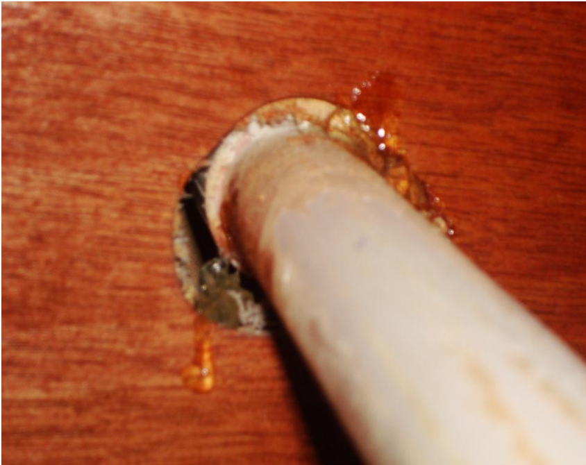
Sloppy and incomplete application